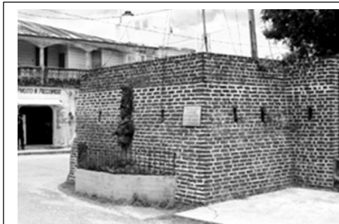
Fort Barlee- Corozal Town

** Caudillos= charm and charisma. Mostly military leaders who were capable of maintaining order in a society that had become armed and militarized in the wars.