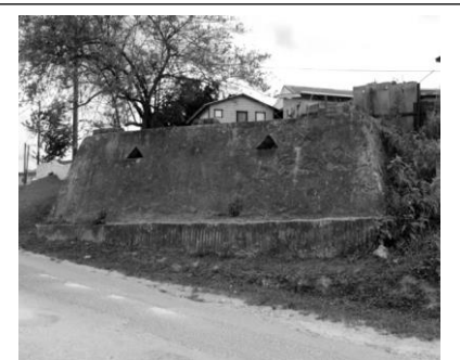
Fort Mundy- O-Walk Town