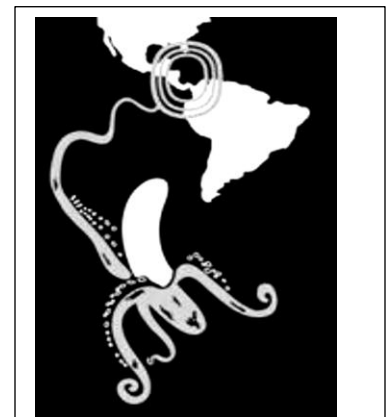
UNITED FRUIT COMPANY – A.K.A. “The Octopus” [El Pulpo]